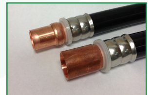
COMPLETED CRIMP CONNECTION